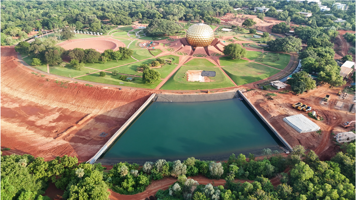
Matrimandir Lake section 1 looks pristine from this drone view. To the left one sees the longer excavation of Lake section 2.