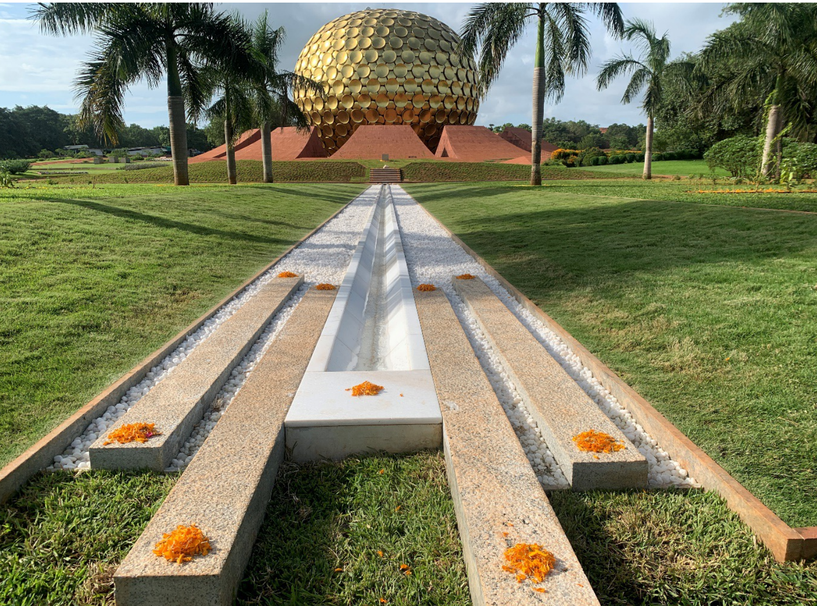
The Garden of Light features an arrow like marble clad stream pointing towards a large piece of natural crystal at the focus of the garden.

After intense activity during the first two weeks of August, the garden was unveiled for the visitation of all.