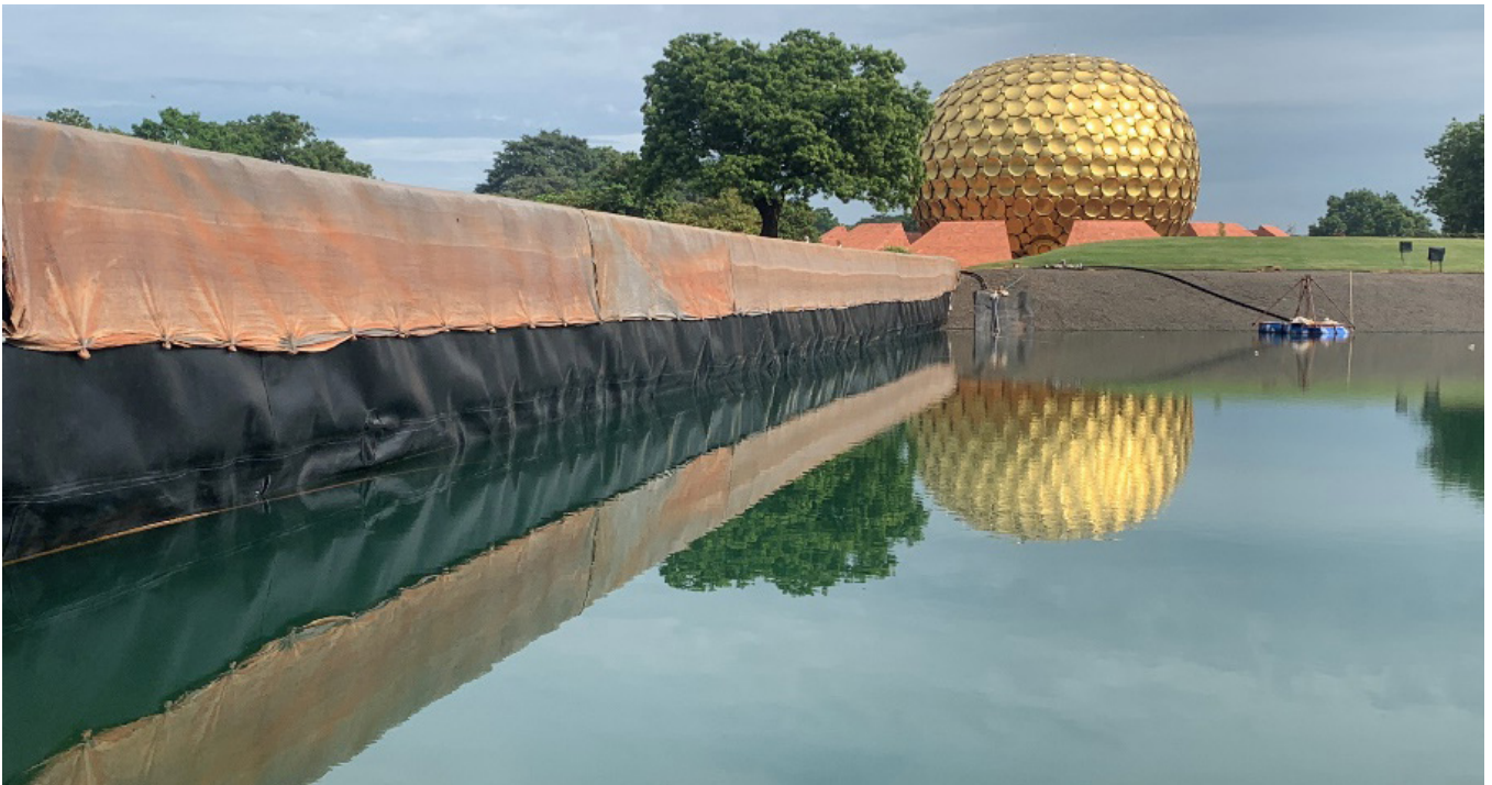
The end walls, now fully sealed, wait for the influx of winter monsoon rains to fill up the few remaining meters of the lake.