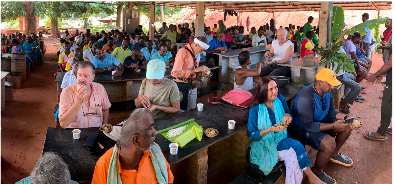
The Matrimandir team gathers at the time of Saraswati Puja