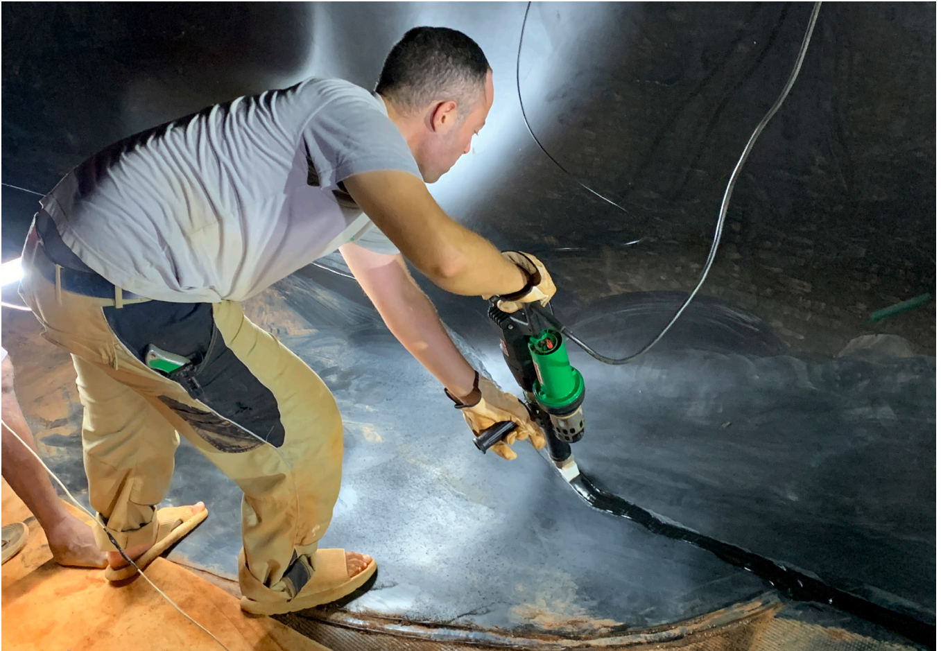
The experienced welder joins the sheets of waterproofing membrane to cover the two end walls.

be snow”. One tries to imagine this improbable, yet foreseen scenario! It is one of the deep mysteries of Auroville.